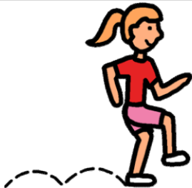
hop in place