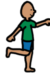
back leg kicks